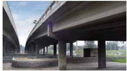
AWARD OF MERIT: Strengthening Category