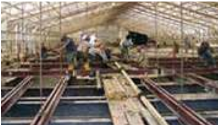
AWARD OF MERIT: Parking Structures Category