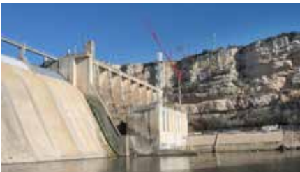
AWARD OF MERIT: Water Structures Category