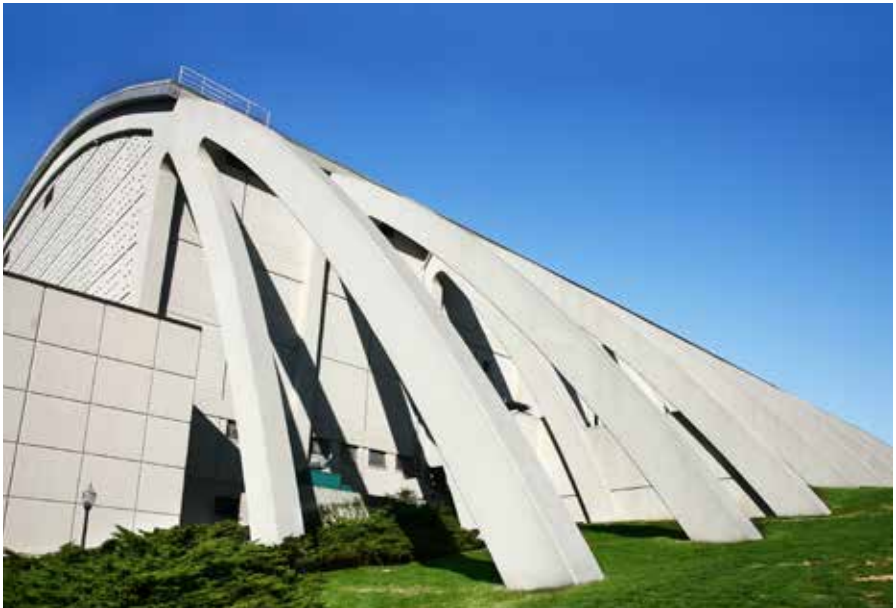
Cassel Coliseum, Lyndhurst NJ

Exterior Renovations to Cassell Coliseum Lyndhurst, New Jersey