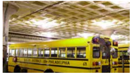
AWARD OF MERIT: Special Projects Category