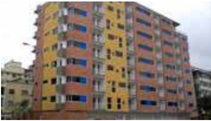
AWARD OF MERIT: Strengthening Category