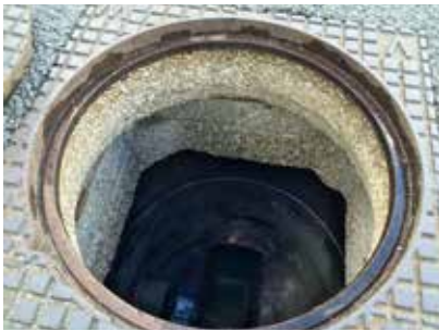
Manhole sewer entry after only 3 years in service exposed to biogenic corrosion.

Even though these processes and the resulting corrosion and maintenance problems on concrete and steel structures are really well known, including the bad smell of rotten eggs that is given off, our sewerage systems still suffer constantly from it.