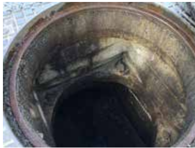
Manhole entry to storm water network after 3 years of service showing no deterioration.