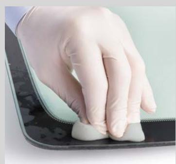
■ To remove contamination: wet Sika<sup>®</sup> Cleaner PCA with Sika<sup>®</sup> CleanGlass and rub the area